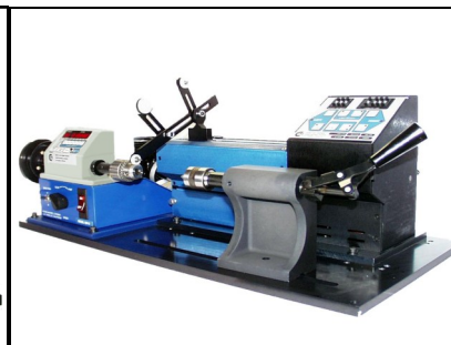
With 1201 Winder / Accessories