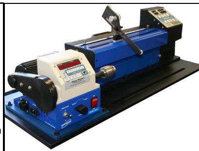
With 1201 Winder / Accessories