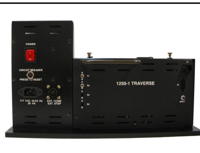
High Quality Components