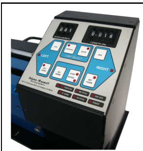
User Friendly Interface