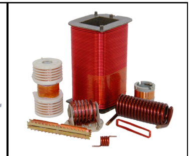
Custom Tooling Available